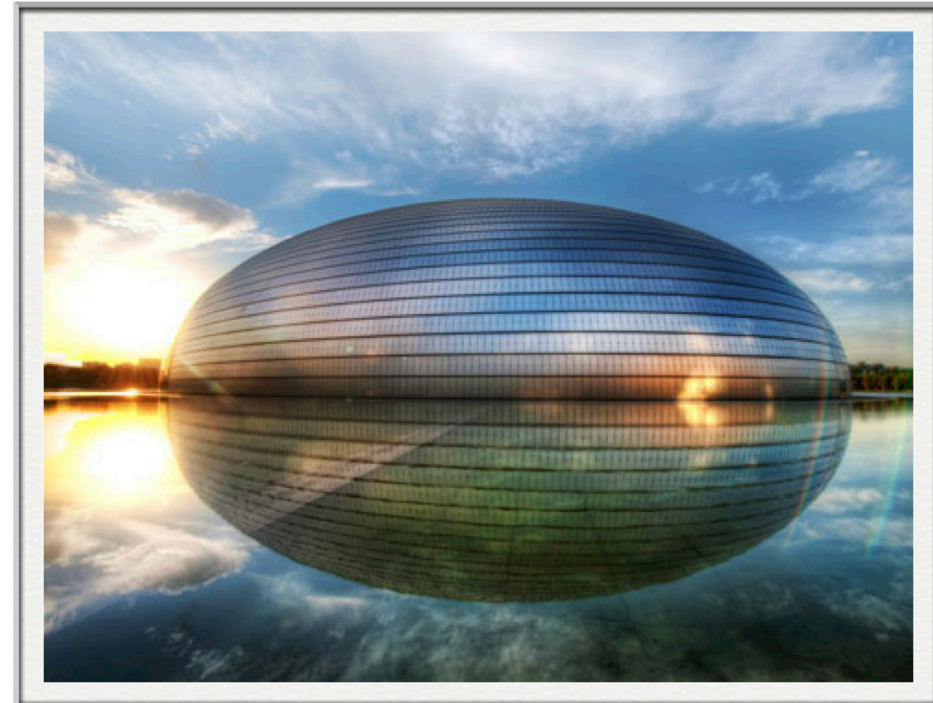
National Center for the Performing Arts, 2007