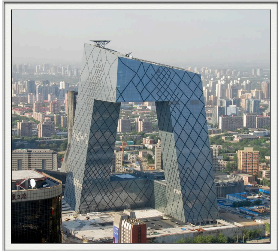
CCTV Headquarters, 2012