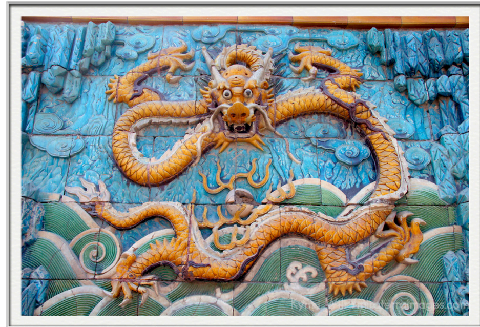
Golden Dragon, Forbidden City, 1771