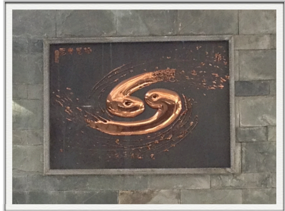
Institute for High Energy Physics, 1973