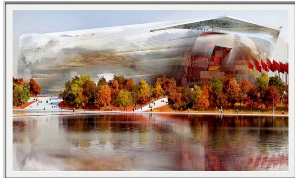
National Art Museum of China (proposed)