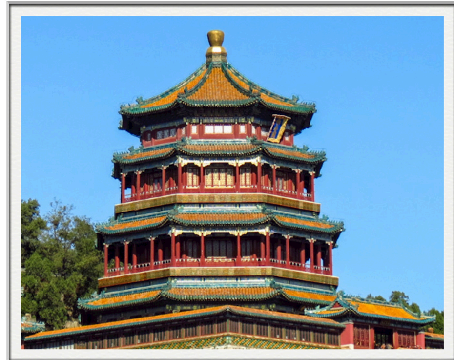
Summer Palace, 1750