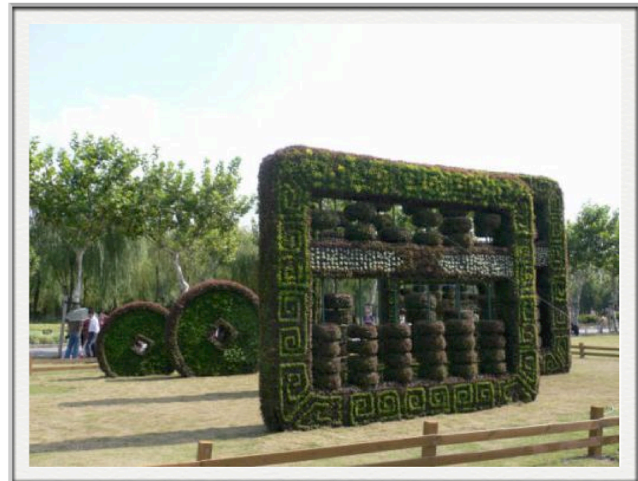
Olympic Gardens, 2008