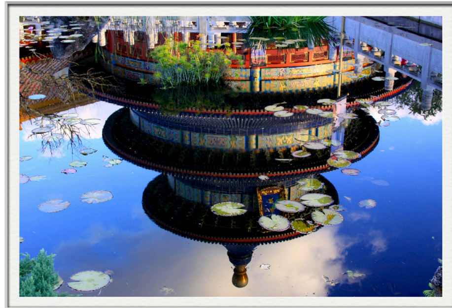
Temple of Heaven, 1420 (reflection)