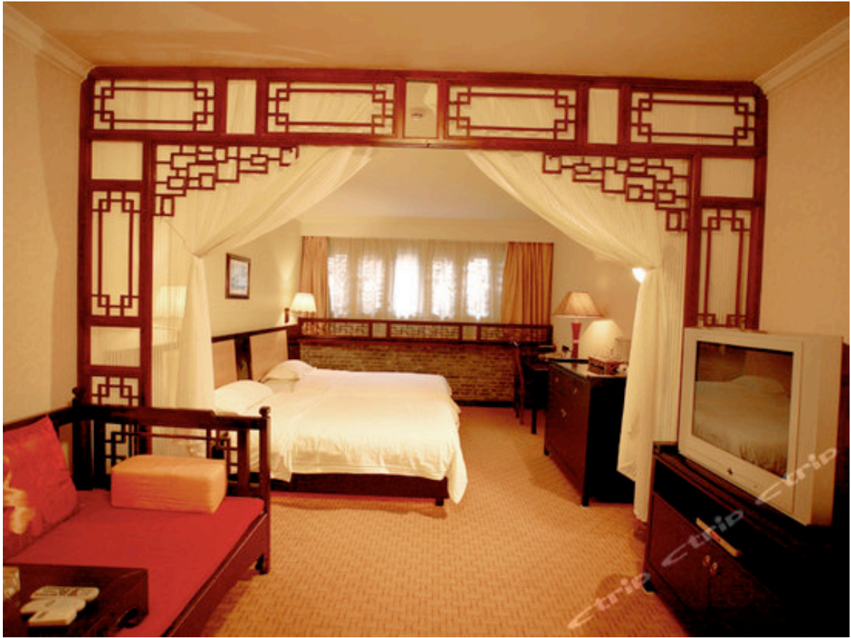
Room D: Executive business suite (RMB: 1080)