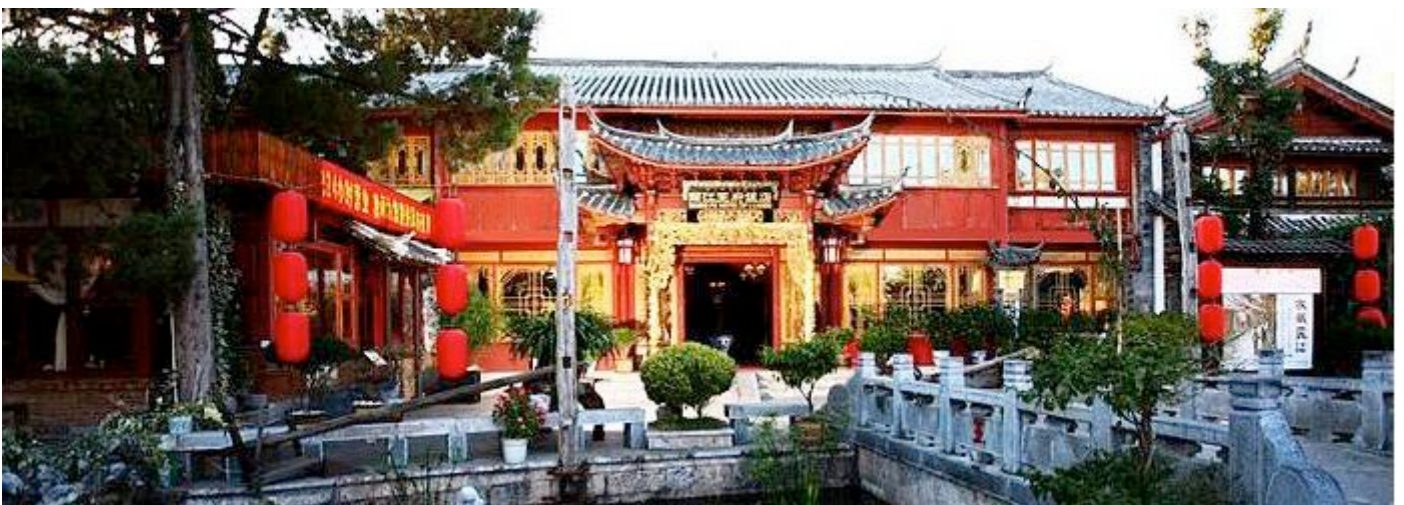
The Wang-Fu Hotel and Its Front.