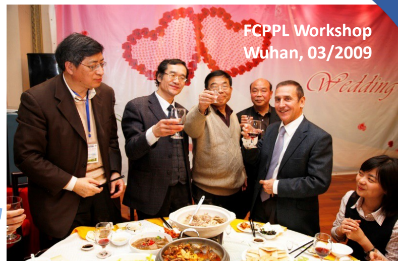
FCPPL Workshop Wuhan, 03/2009

Beijing (IHEP), 12/2006 (to prepare FCPPL)