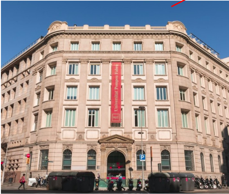
UPF (Balmes building)