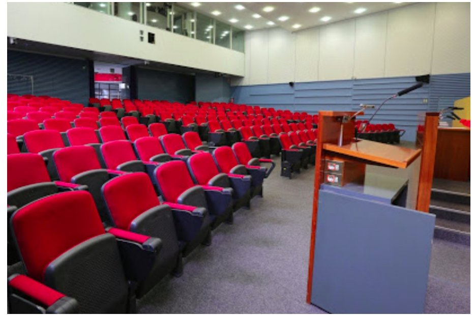
Meeting rooms with central zoom services